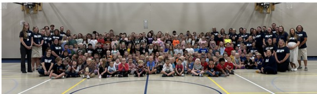
Winsted Elementary Staff & Students

School is an exciting place full of learning, love and joy. Help your child have a great adjustment to enjoy their day at school and the evening at home with you!