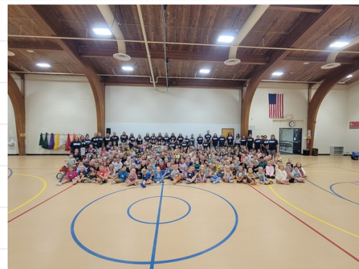
Humphrey Elementary Staff & Students