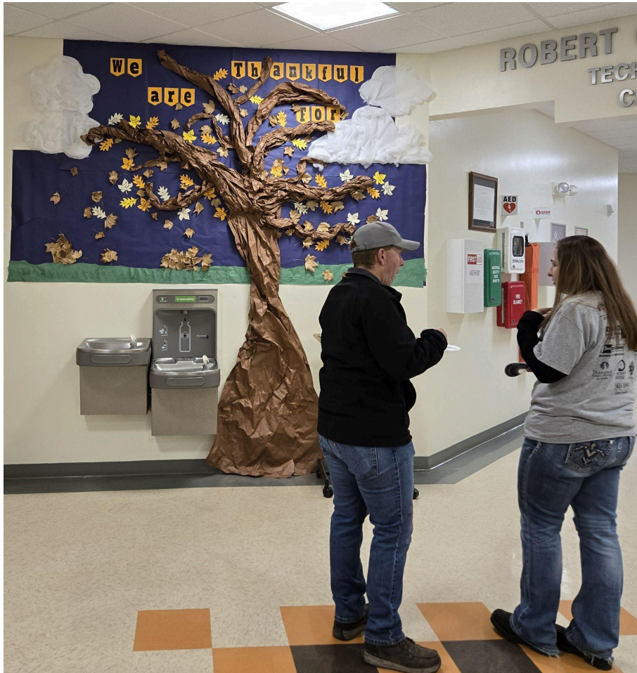
The Gratitude Tree