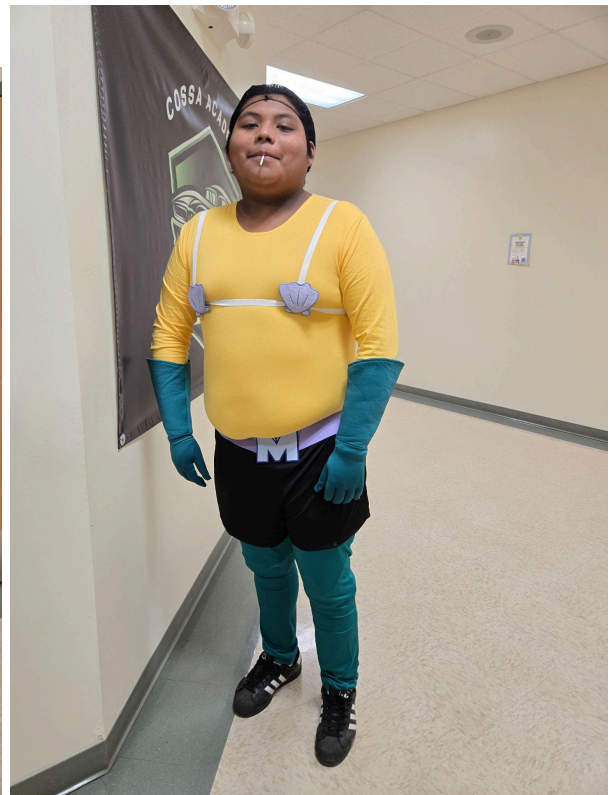
The ALL AROUND winning costume (Mermaid Man)