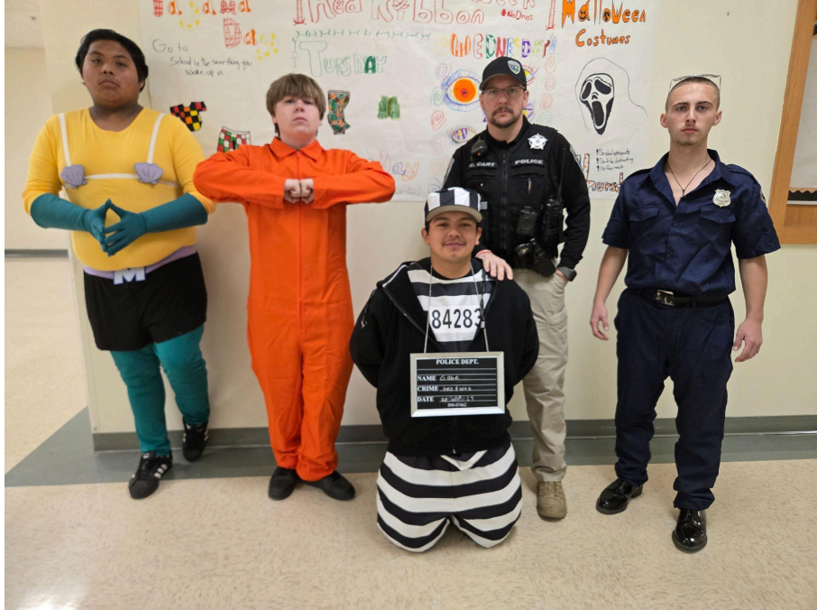
SRO Cart in on the fun