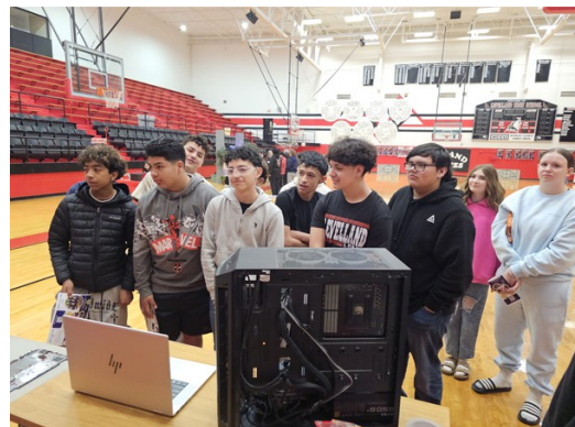
8th Grade HS Tours!