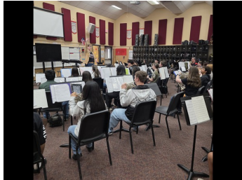
Preparing for the Spring Concert!