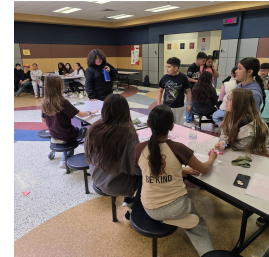
Math Saturday Remediation!