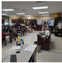
Science STAAR Review