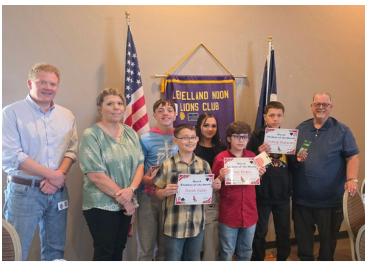
March Students of the Month!