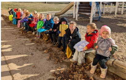
Kindergarteners show off their outdoor learning bags!