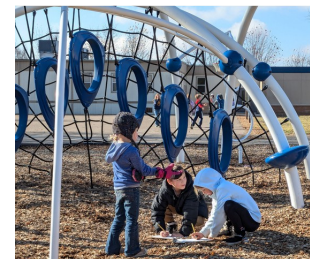
Outdoor scavenger hunt.