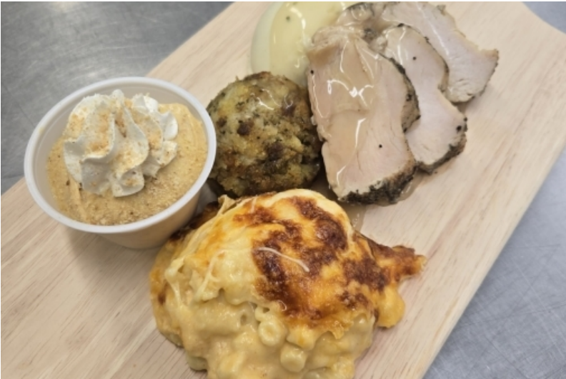
Thanksgiving Meal – Herb Brined Roasted Turkey Breast, Dressing, Baked Mac and Cheese, Yukon Gold Mashed Potatoes with Pan Gravy and Pumpkin Pudding Parfait