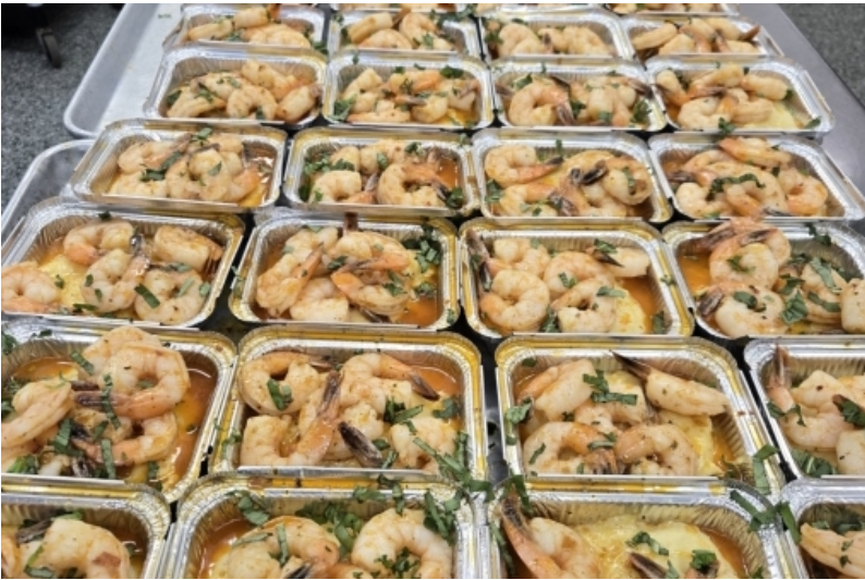
Harissa Shrimp w/ Parmesan Polenta