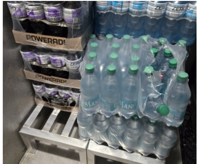
New Storage Dunnage Racks