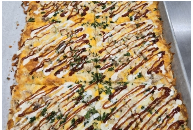
BBQ Ranch Chicken Flatbread