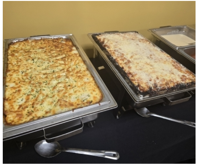
HS Conference Catering. Chicken Alfredo Bake, Meatball Ziti Bake, Garlic Breadsticks, Garden Salad, Red Velvet Cake and Peanut Butter Buckeyes