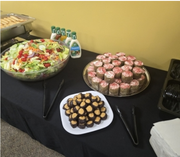
HS Conference Catering