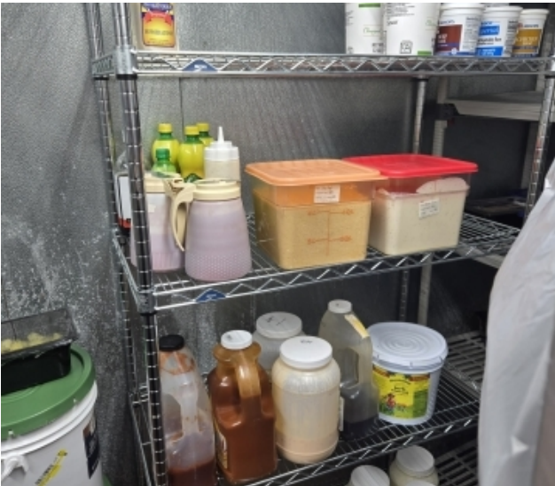
New Cooler Shelving