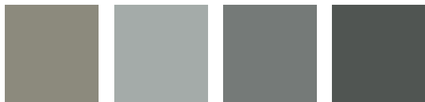
179 Steel WG 69 Sterling Silver CG 178 Ironstone CG 82 Black Pearl B

Color plays a key role in interior design and the Tarkett Solution SPECTrum™. By coordinating all flooring and accessory solutions across a balanced, harmonized palette, we've combined simplicity with creative freedom to help you create beautiful, productive spaces.