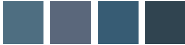
58 Windsor Blue VN5 The Blues 84 Blue Jeans 92 Blue Lagoon