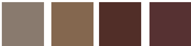
107 Neutrality TA7 Rusty Nail 132 Espresso 85 Burgundy