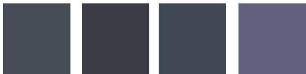
TH3 Inkwell TA9 Indigo TH2 Blue Intensity TB4 Grapest