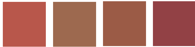
TG8 Spicy Chip VL9 Red Clay VL7 Sailor Red TB6 Flame