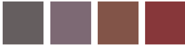
TG9 Poetry Plum VM2 Shoreline Purple VM3 Misted Plum 163 Salsa