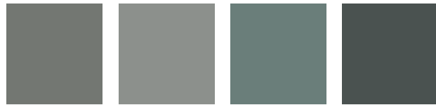
282 Vaporize VM4 Green Smoke VN4 Green Vista 168 Thunder