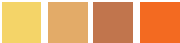
TG7 Canary VM8 Mr Sunshine VM1 Hot Spice 62 Tangerine Tango