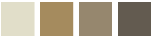
77 White Pearl W 67 Old Gold 176 Brass WB 66 Either Ore