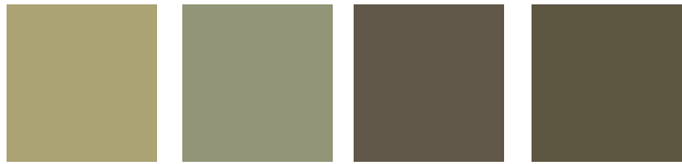
151 Iguana VN3 Gecko 264 Grounded TB2 Boxwood