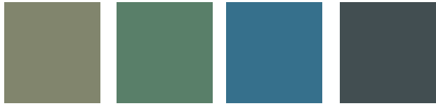
TH1 Glenhaven VL8 Grinch VM5 Dream Teal 72 Harbour