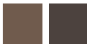
TA2 Saddlebrook 284 Ganache