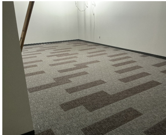
Flooring installation on the 1 st floor