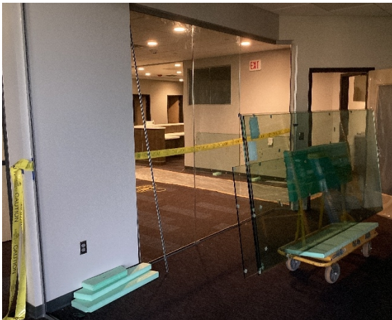
Demountable glass partitions on the 2 nd floor