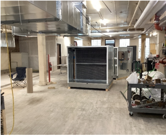
Mechanical infrastructure delivery on 3rd floor