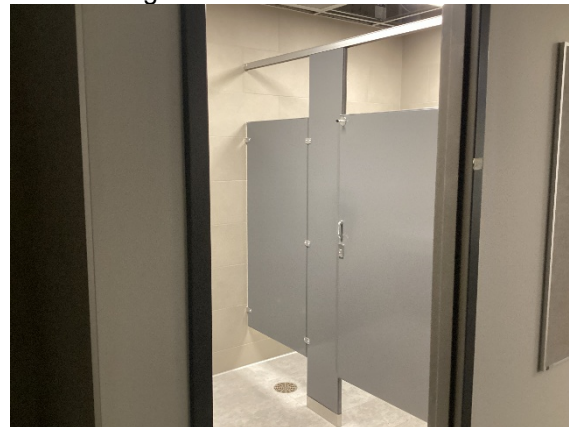
Bathroom partitions on the 2 nd floor