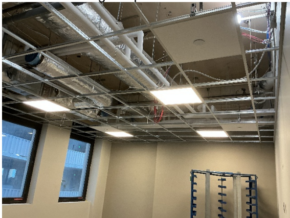
Electrical finishes on the 1 st floor