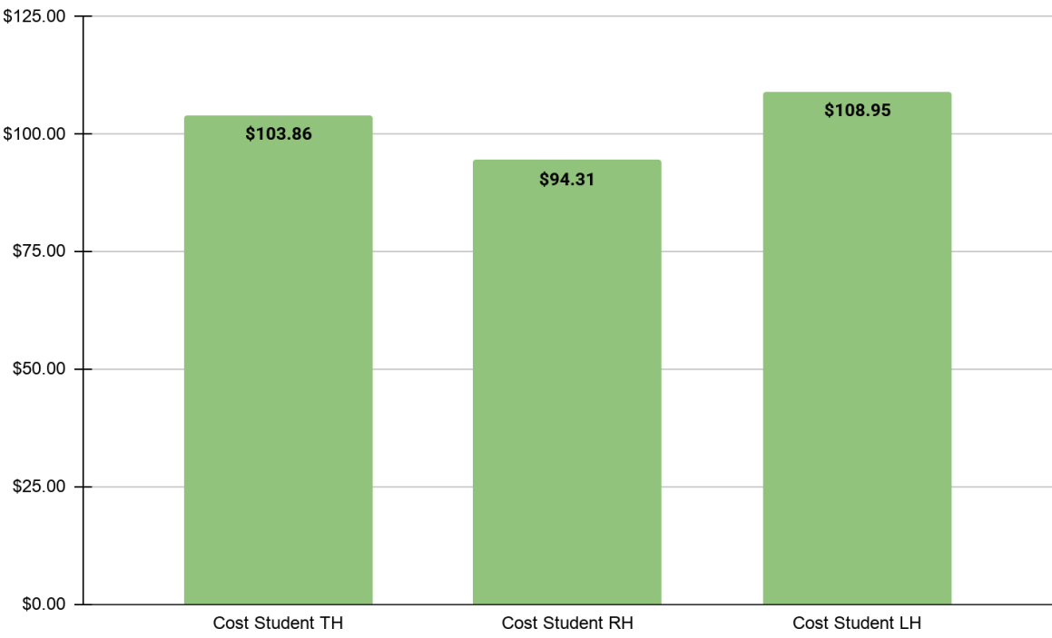
Cost Per Student Technology Subscriptions

The number of software packages average out to the following estimated costs per student within the three schools. These costs are estimated based upon enrollment. These estimated costs include packages that would be essential to access resources at the individual school, along with package costs that would be part of a district subscription.