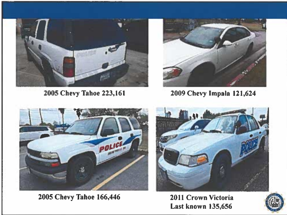
2005 Chevy Tahoe 223,161