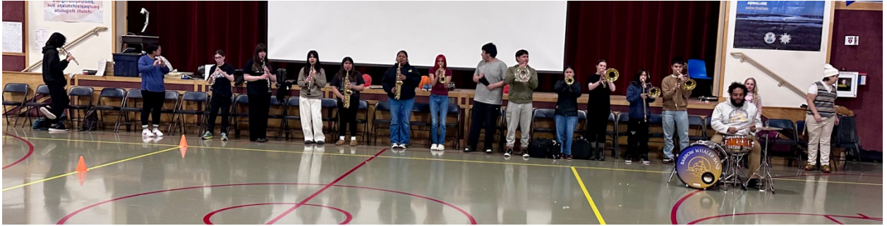
The Pep Band came and performed.