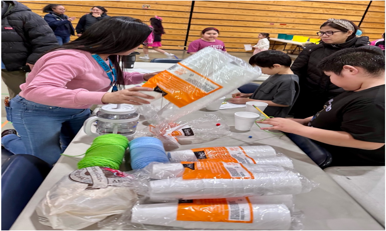
We had games for all ages and we had concession food