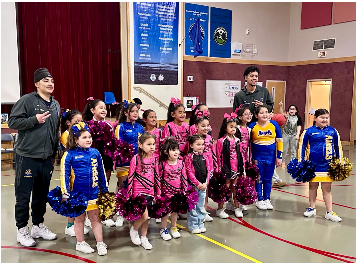
Little Whaler cheerleader gave us spirit.