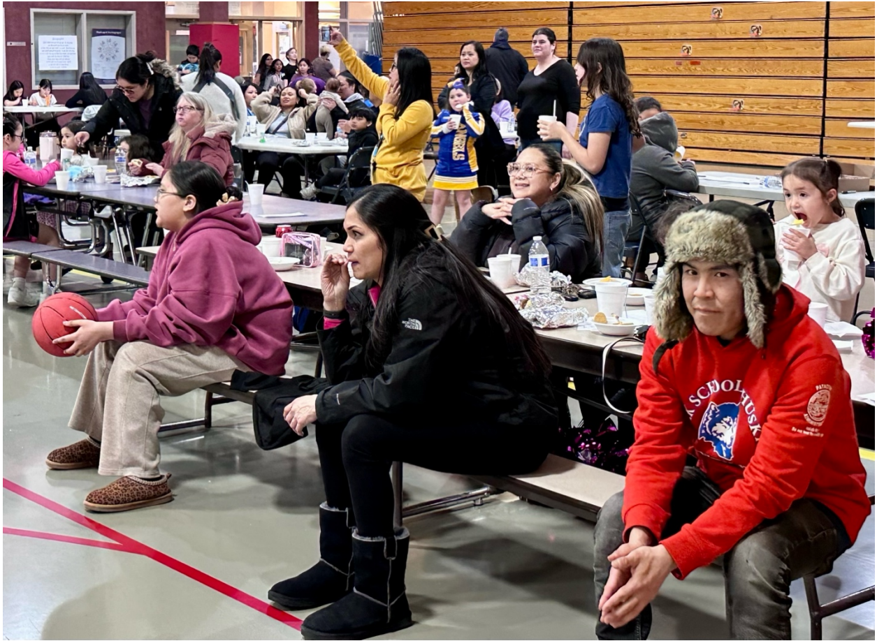
Winner of the Free Throw Contest