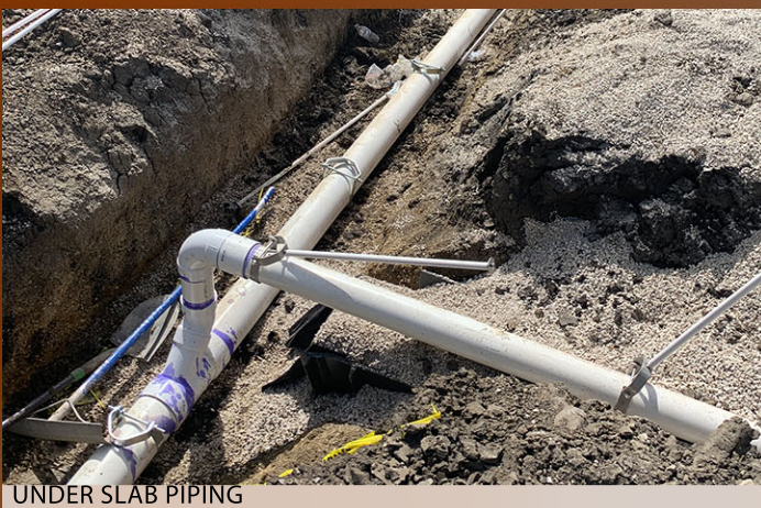
UNDER SLAB PIPING