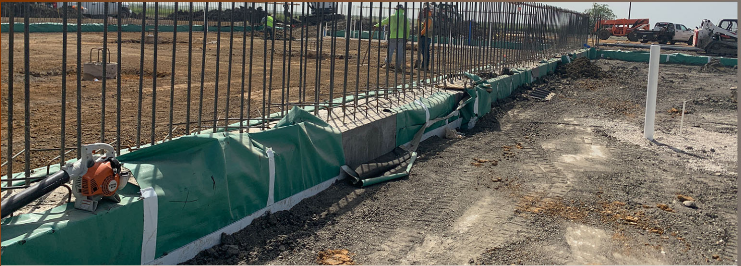
STORM SHELTER REINFORCING